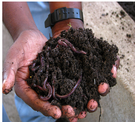
Raw compost with worms