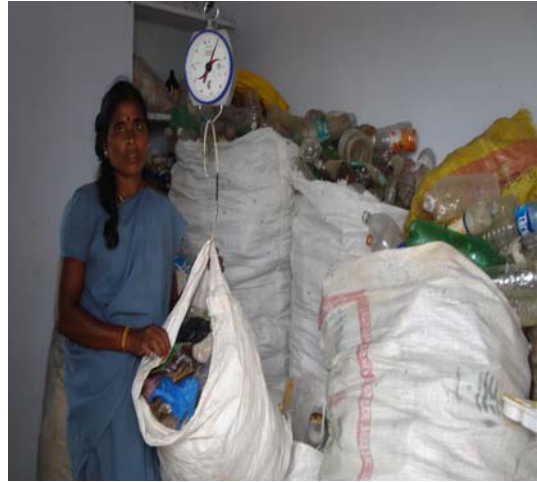
Woman participating in Recycling