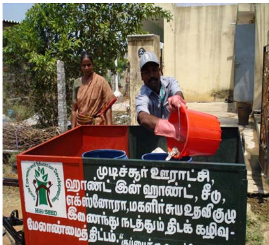
Waste collecting from households