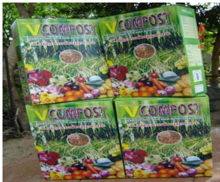
← Compost for sale