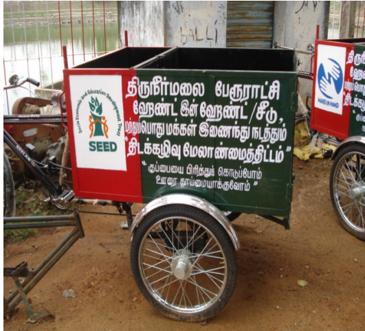
Waste collecting tricycle