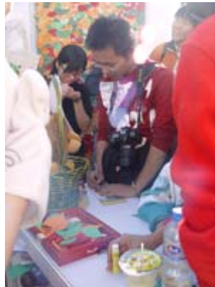
Plastic Reduction Action in University campus