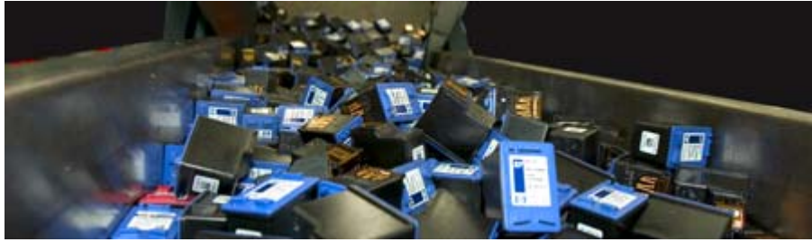
Cartridges for Dragon Recycling