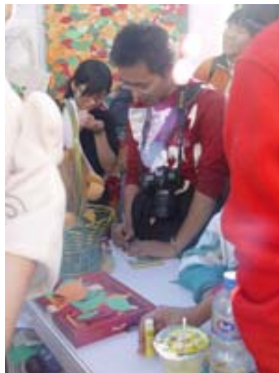
Plastic Reduction Action in Universities