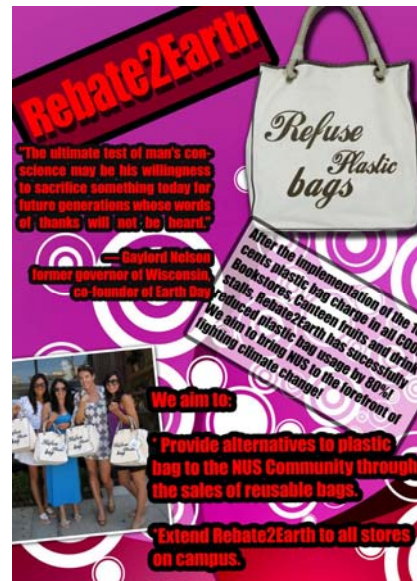
Posters concerning 3Rs practice